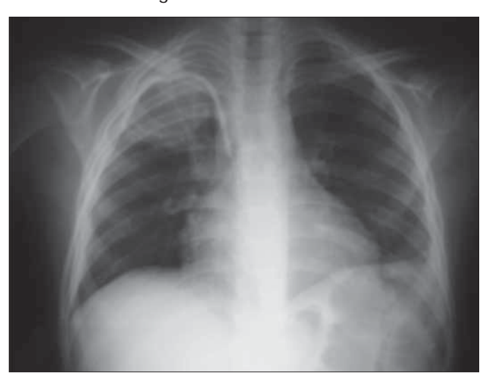
Figure 1. Chest X Ray showed pulmonary infiltration in the superior lobe of right lung

He developed edema, hyperemia in the right orbit, and ecchymoses in the right superior palpebra. Immediate evaluation with paranasal/orbital tomography showed mucosal thickening of bilateral ethmoid sinuses with loss