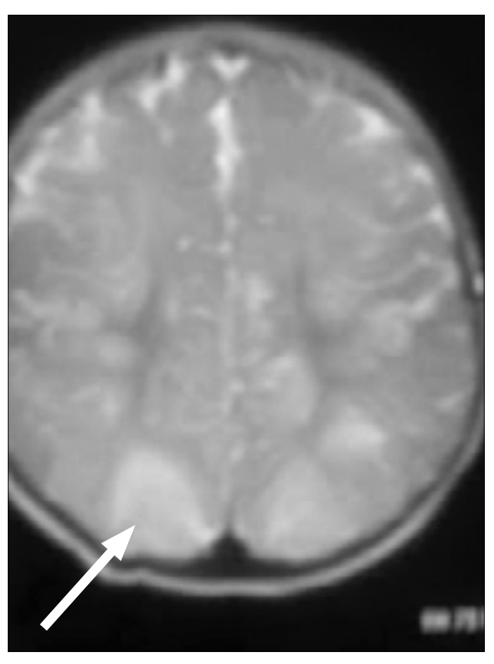
Figure 1. Cranial magnetic resonance imaging (MRI) showing diffuse occipital edema

Neurological findings may occur in 2-5% of rotavirus gastroenteritis (7). These vary from benign convulsions to lethal encephalitis (7). Some studies showed that <4% of rotavirus hospitalizations are associated with CNS diagnoses (7). It is not clear how rotavirus would affect CNS without direct invasion. Kawashima reported that serum and CSF nitric metabolites have been reported to be elevated in patients with rotavirus gastroenteritis-induced convulsions (8). The spectrum of neurological disease associated with rotavirus infection in children varies from uncomplicated febrile seizures to frank encephalitis with residual morbidity. The virus may cause afebrile seizures