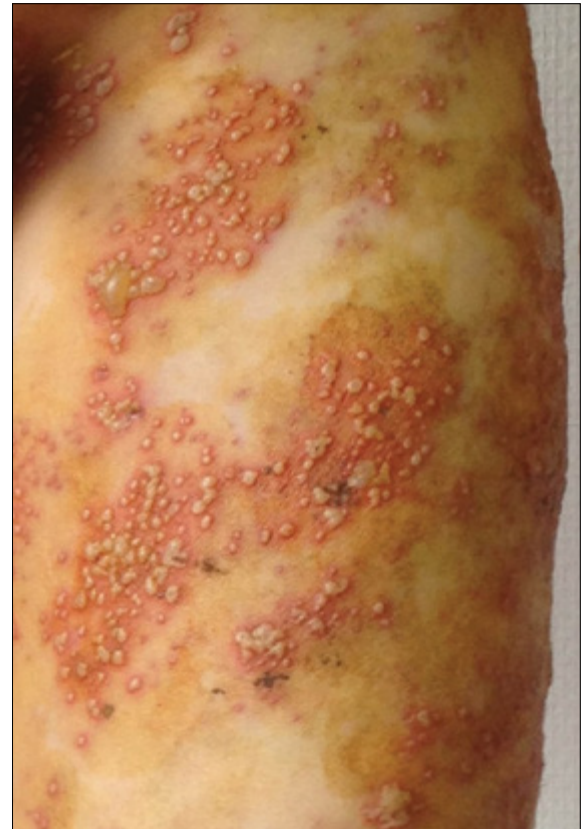
Figure 2. Up-close view of the rash, vesicular in the same phase