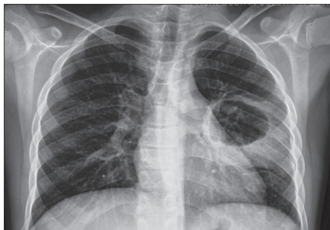
Figure 2. Chest X-ray of lung cyst in the left lobe.